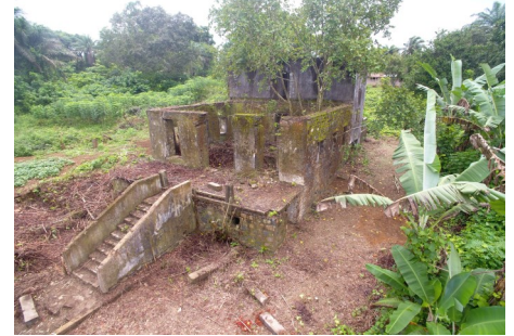
Ruins of the Porte family home in Crozierville

Barbados' historical relationship with Crozierville.