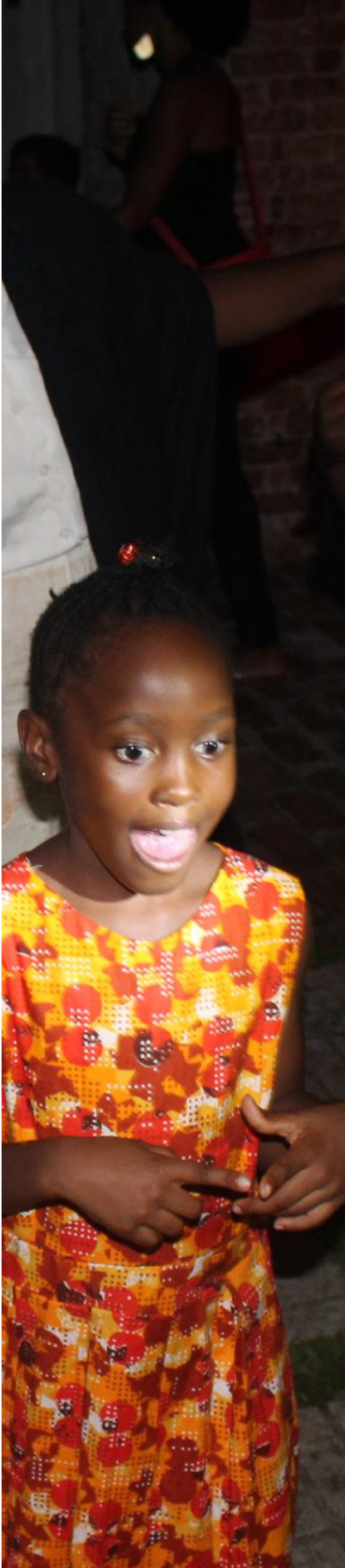
A young patron enjoys a Torchlight Tour.