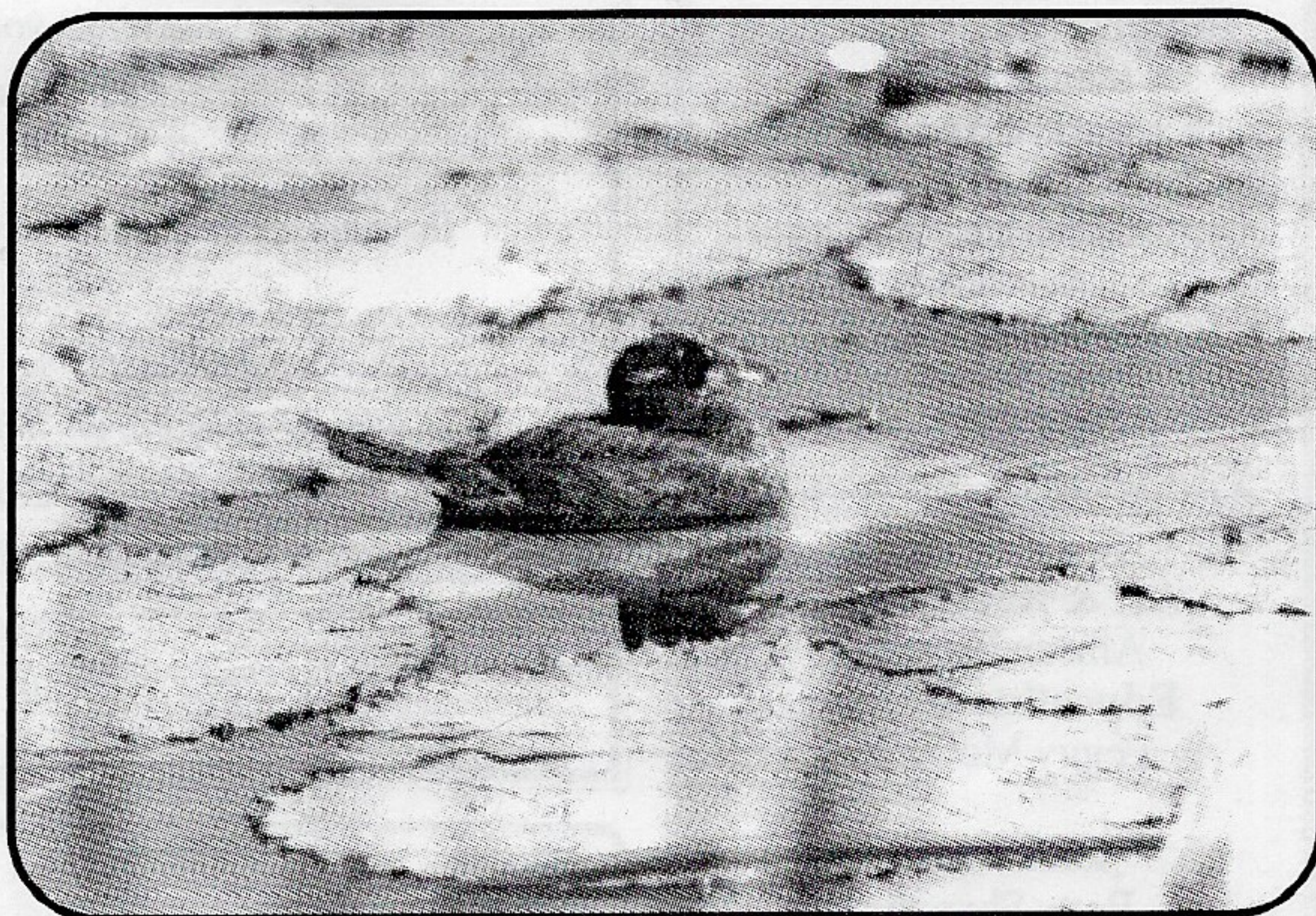
A Masked Duck at ease on a Barbadian Pond, one of the full colour images found in the 2001 Journal of the Barbados Museum & Historical Society