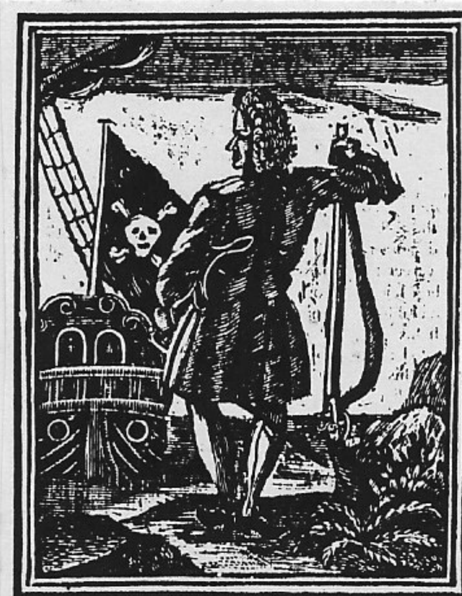
Stede Bonnet From Caribbean Pirates by Warren Alleyne © Copyright The Macmillan Press Ltd 1986