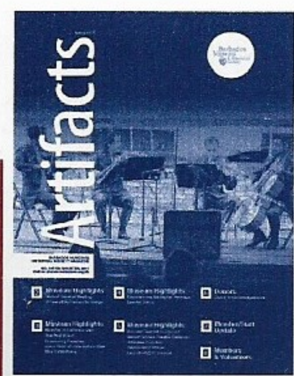
On Cover: The Borusan Quartet in concert at the Museum