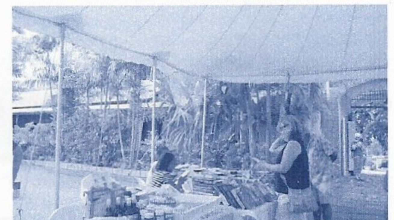
Visitors browsing through the used books on sale at the Library Book Stall.