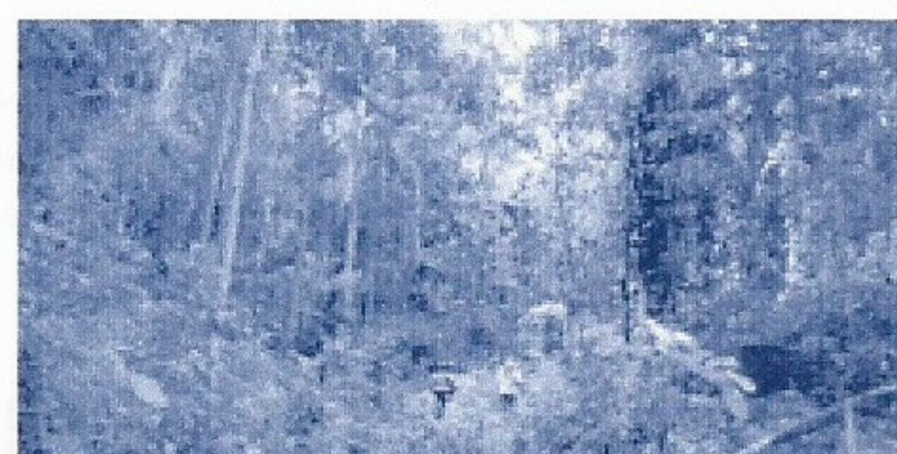
Into the Great Beyond, winning photo in the People category