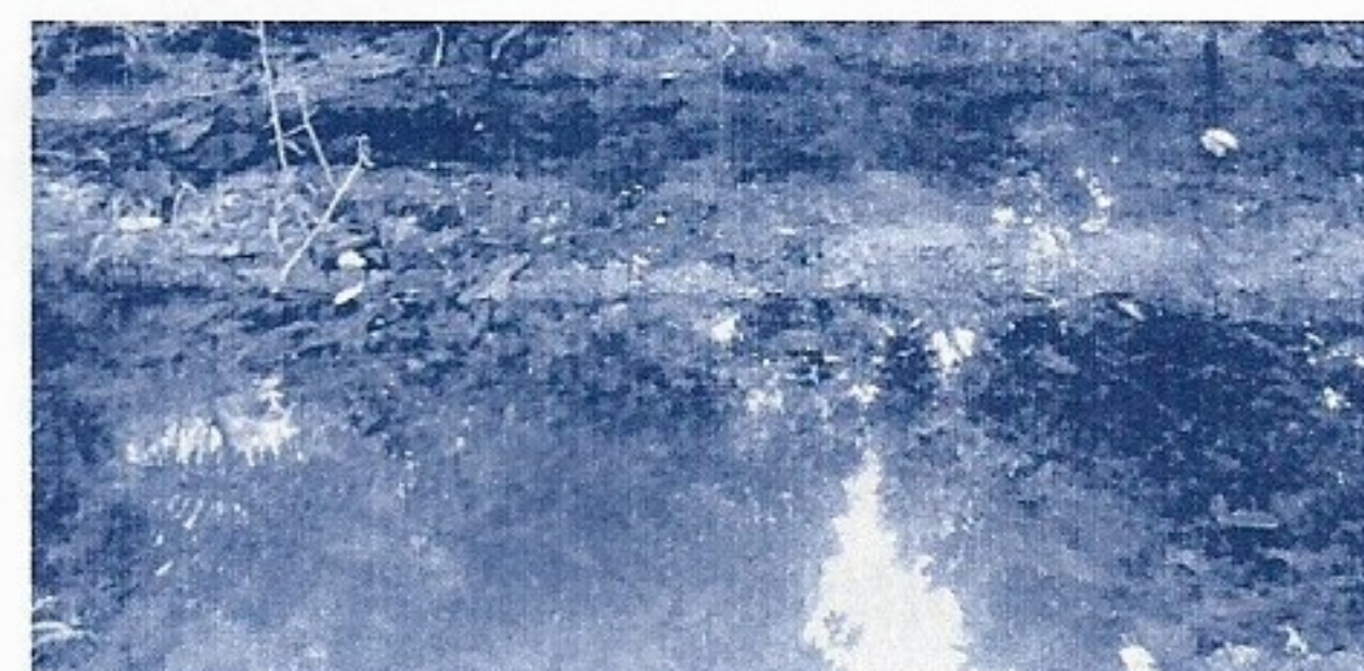
Reflections, winning photo in the Landscapes category