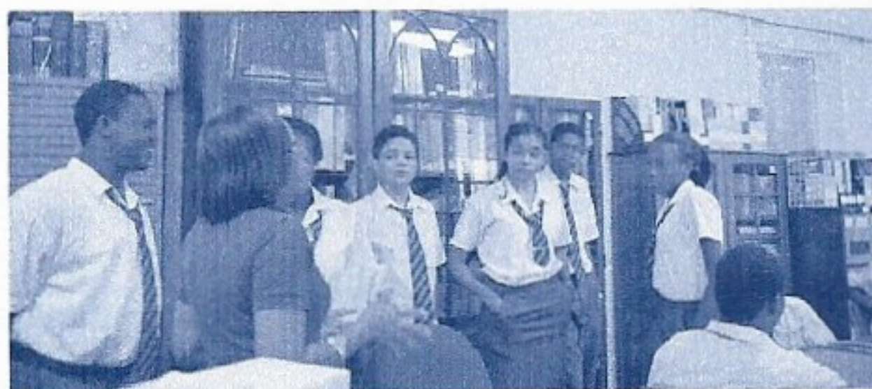
Combermere School students on a tour of the Library