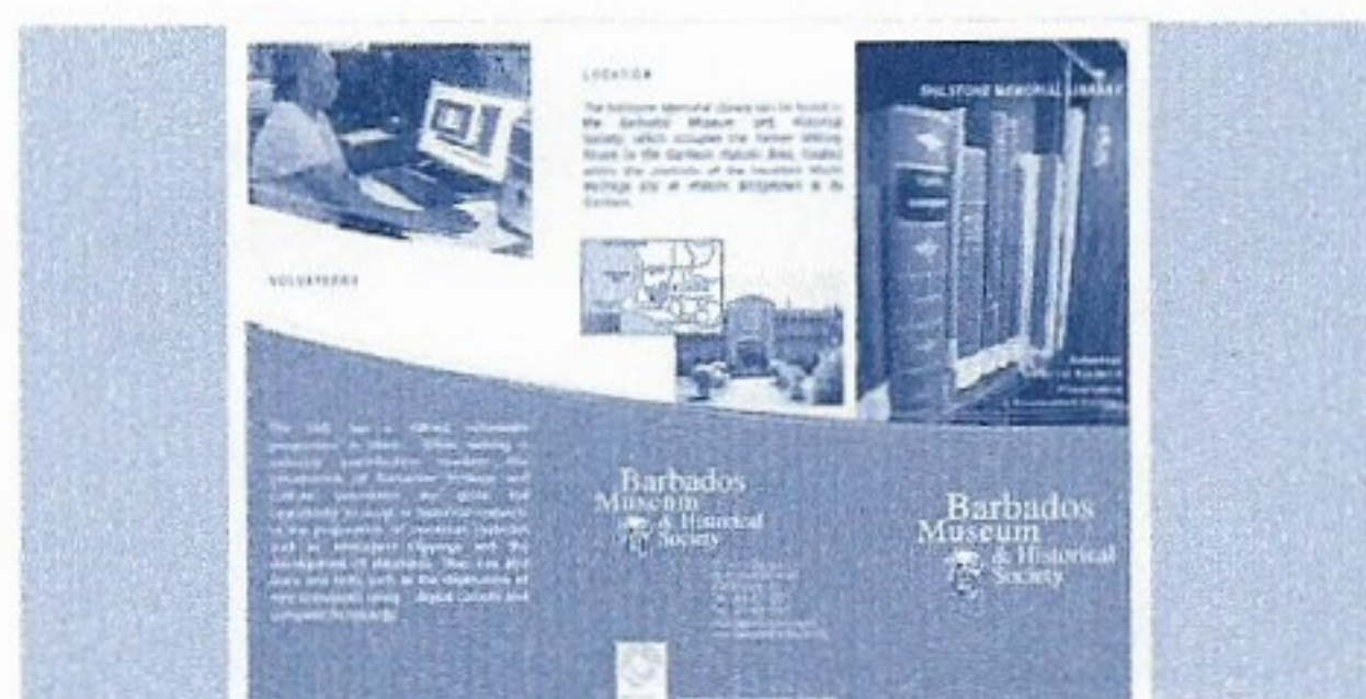
The Library Guide