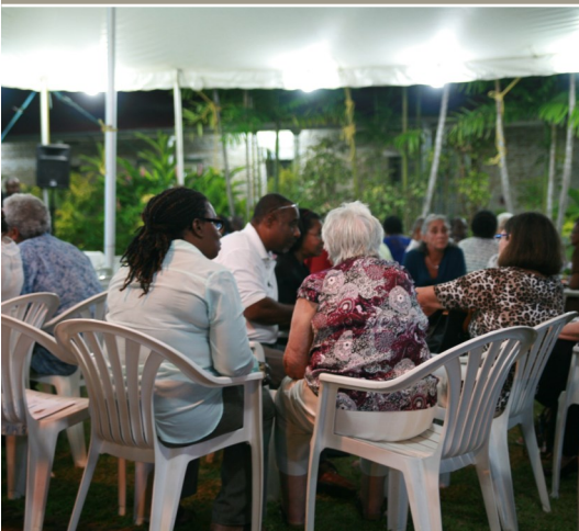
Members of the Group in discussion.

“To inspire and encourage Barbadian -related family history research and to foster the development of individual and shared identities.”