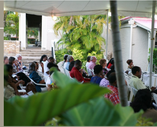
Members of the Genealogy Group at its launch in 2014.

The group meets every other month on alternate Wednesdays or Thursdays at 6pm at the Barbados Museum. Interesting speakers and topics are highlighted.