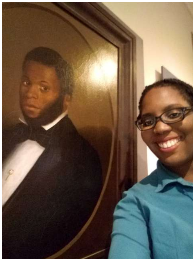
Pictured to the left: BMHS' Development Assistant took a selfie with this 19th century portrait in the selfie spot.