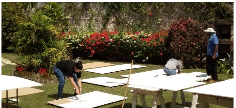
Pictured above: board frames being painted before installation.