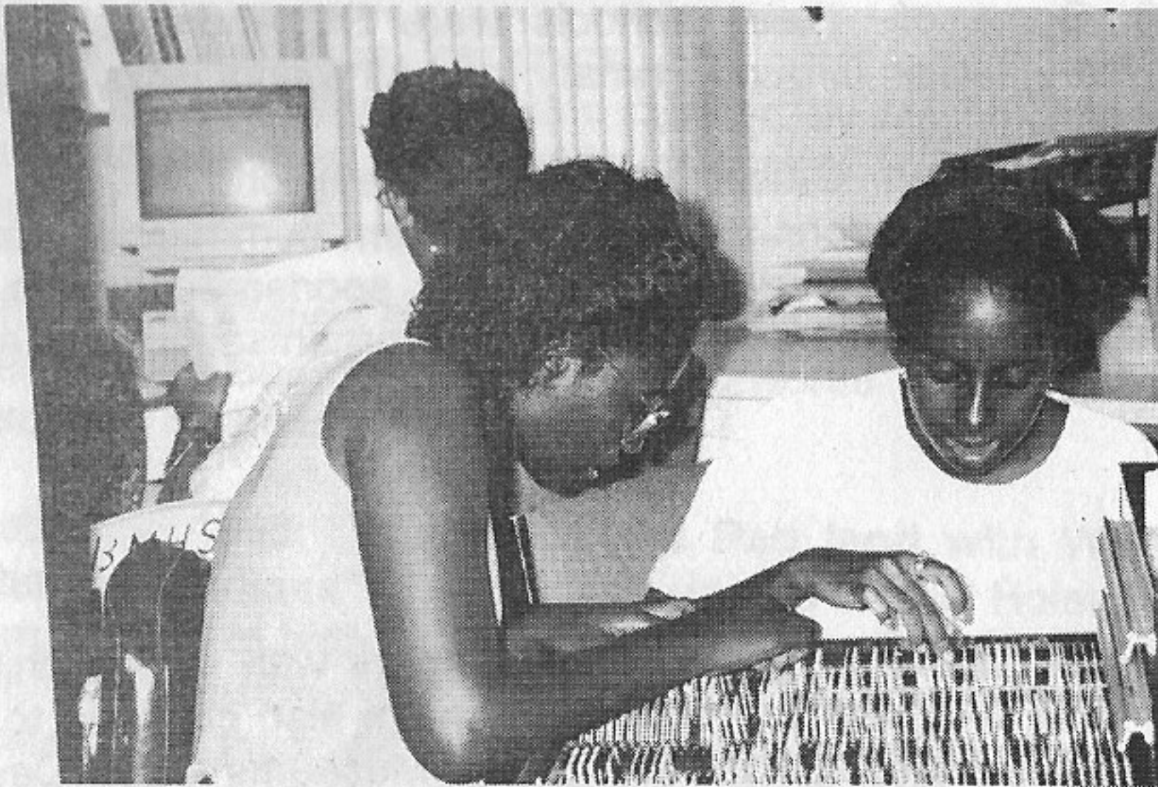
Junior Curators working on the slide collection

Several days between April 2-18 were dedicated to training the Junior Curators, including new recruits. This year's group of Junior Curators were extremely diligent. They did tours with over 1600 persons in a 6 week period, but of even greater importance were the curatorial and administrative tasks with which they assisted. Some of these included: - reorganisation and repacking the archaeology storeroom; assistance with the dry mounting of texts and photographs for an exhibition; replacement of old labels in exhibition galleries; relief work in reception or in the shop for staff on leave; assistance with administrative staff with sorting and storage of archival files.