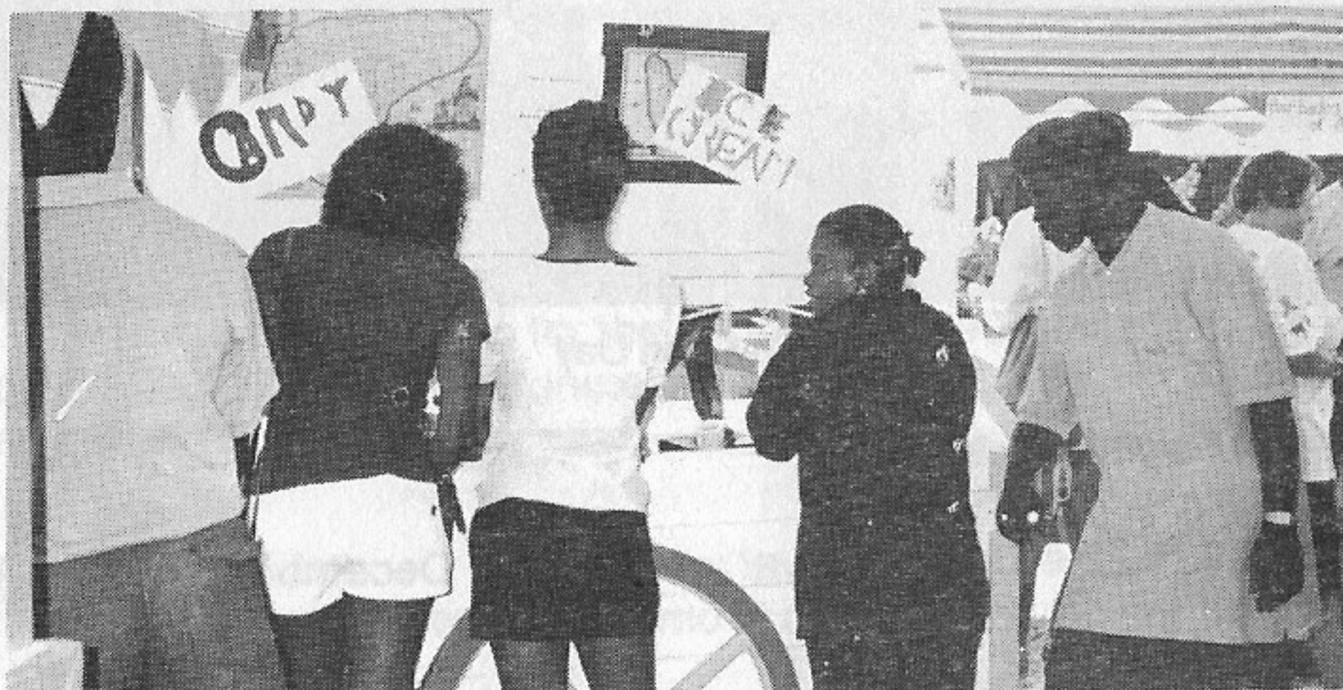
ICOM Barbados Heritage Fair

The final event was a Heritage Fair organised by Barbados National Committee of ICOM in which the Barbados Museum participated held at the Heritage Park.