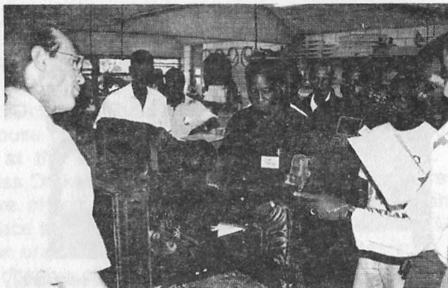
Participants attending the Furniture Conservation Workshop